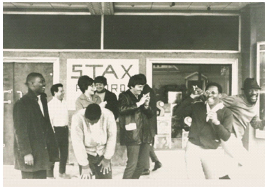
Songwriters and Stax stars have a good time at Stax in its hey day. Shown in this photo are songwriter duo-artists David Porter and Isaac Hayes. Hayes went on to become first Black artist to win an Academy Award for Best Original Song which was “Shaft”.